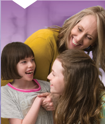
A family living with Dravet syndrome

74% of caregivers report concerns about the emotional impact on siblings of children with Dravet syndrome. 5